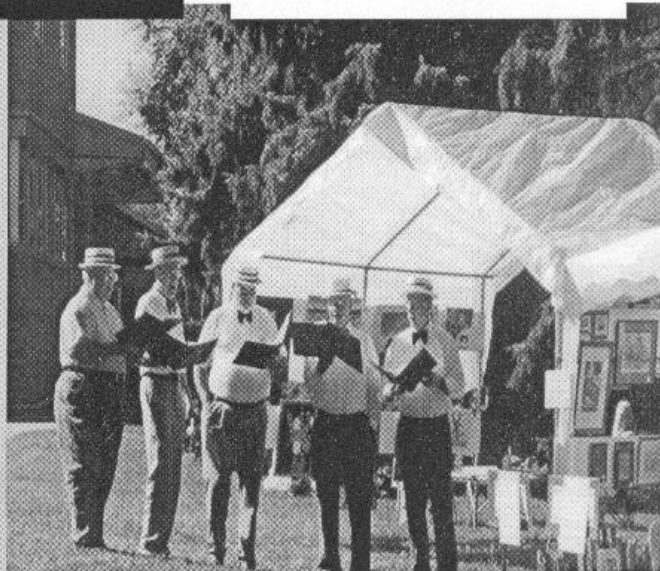
Scene from 2005 Fine Arts Festival

Sponsor $200 Art Patron $100 Friend $ 50