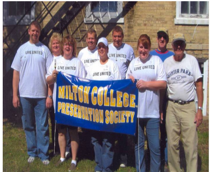
Day of Caring Sam’s Club employees