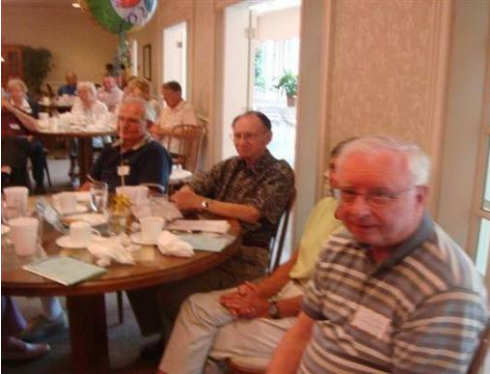
Members of the class of 1958 at reunion weekend