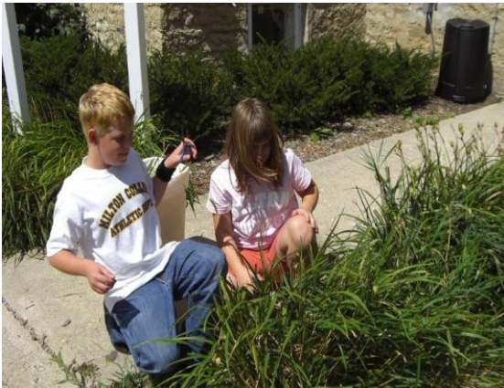
Young volunteers help with weeding

These projects, with the exception of the exterior painting, were done with volunteer help.