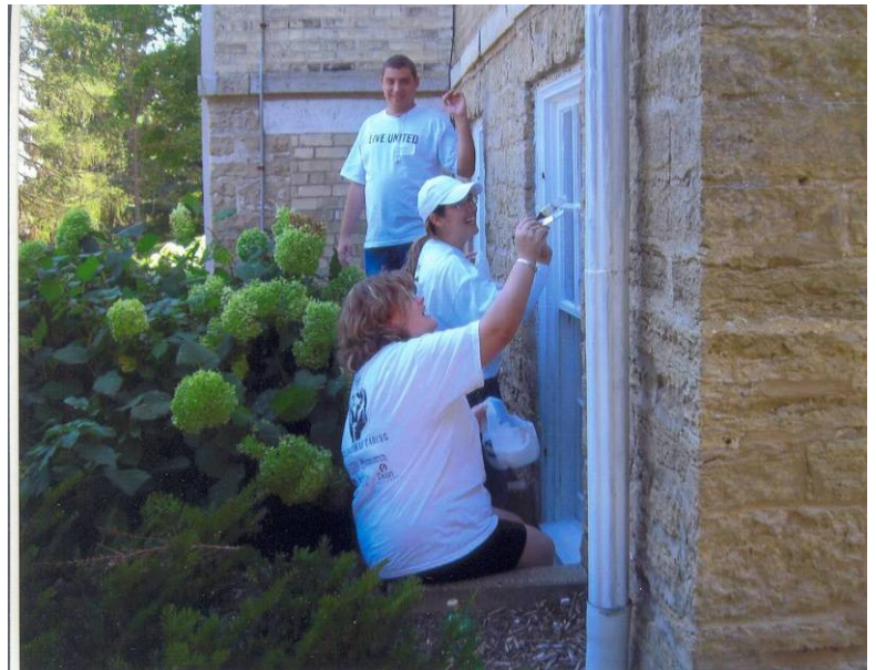
Laughs and smiles helped make the work go faster