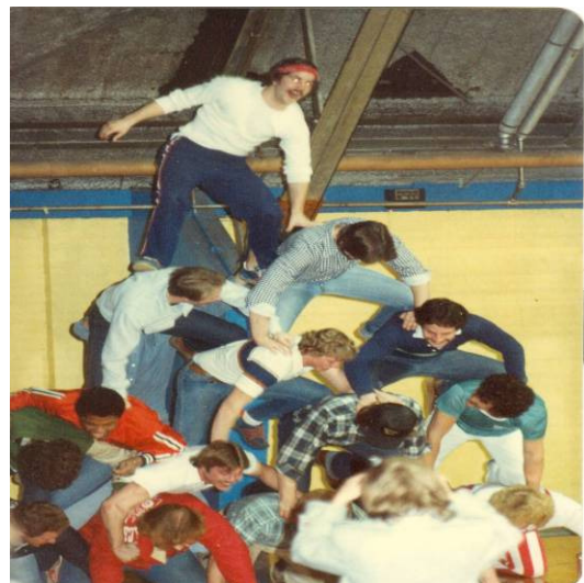
Help keep MCPS on top

2009 membership forms will be mailed separately before the end of the year.