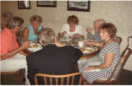
Milton College Annual Weekend June 20, 21, 22 2008

Non-Profit Organization U.S. Postage PAID Milton, WI 53563 PERMIT #35