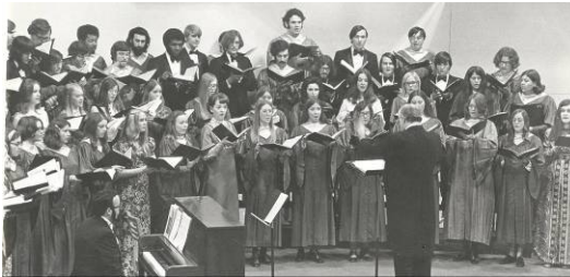
Milton College Choir circa 1972

The cost of the CD is $10.00 and it will be available at the Milton College Weekend in June, or by mail for $15.00. Order form is on page 5 with the weekend registration form.