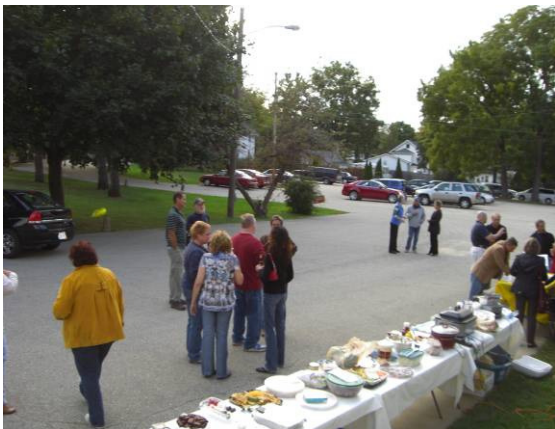
Food, people and cars lined the campus during the tailgate party