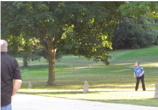
Tailgaters enjoy a game of Frisbee