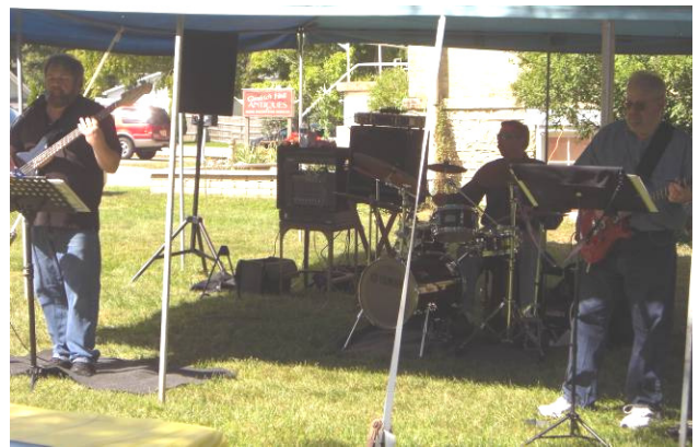
The band "wowed" the crowd