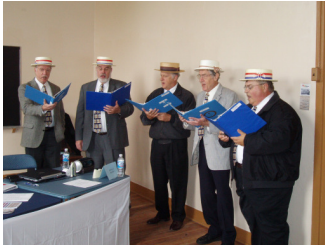
Fine Arts Festival October 14, 2007 11 a.m. to 4 p.m.

Non-Profit Organization U.S. Postage PAID Milton, WI 53563 PERMIT #35